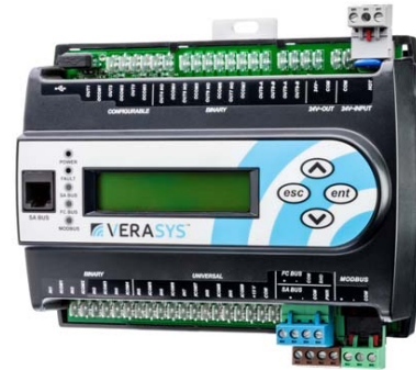
Verasys Equipment Controller

If the VEC fails to operate within its specifications, replace the unit. For a replacement unit, contact the nearest representative.